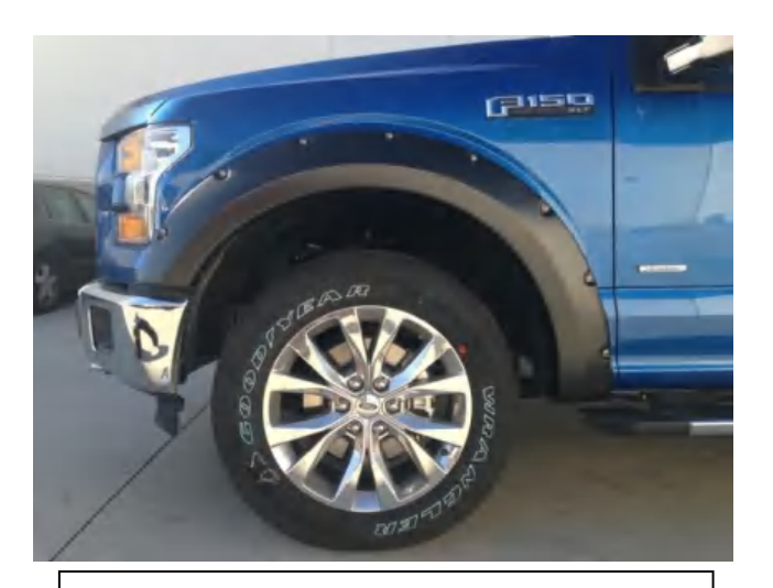
STEP 6: Repeat installation method for other side. Double check the front Fender Flares to make sure all bolts are tight and clips are securely fastened. Your installation is now complete. Do not use abrasive cleaners.

For Technical Support/Warranty Information please call 800-757-7075 EGR Inc., 4000 East Greystone Drive, Ontario, CA 91761