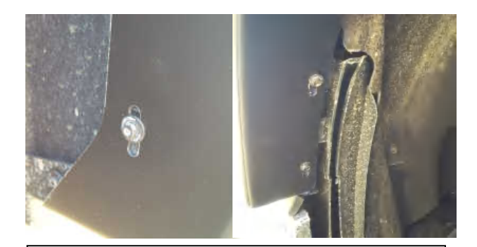
STEP 5: Reinstall the remaining 5.5mm bolt and two 7mm bolts.