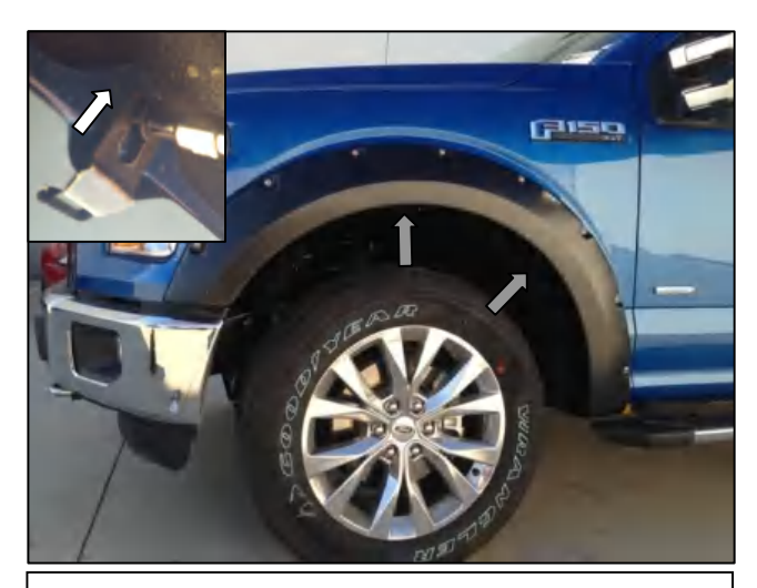
STEP 3: Place the Fender Flare onto the vehicle and fit into the correct position following the contours of the body. Use four (4) of the .6mm clips (two (2) per side) to secure the Fender Flare to the body. Make sure the dimple in the clip securely attaches in the slot on the Fender Flare.

Front Bolt-On/Rugged Look Fender Flares Ford F150 (15-On) FF837