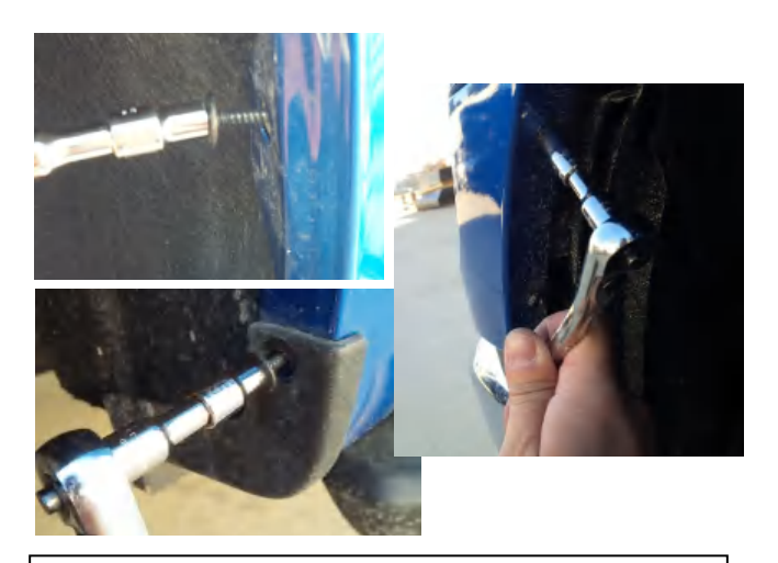
STEP 4: Insert four (4) of the .9mm lever retaining clips (two (2) per side) into the Fender Flare. Make sure the tab in the clip securely attaches in the slot on the Fender Flare. Secure with five (5) bolts removed in Step 6.