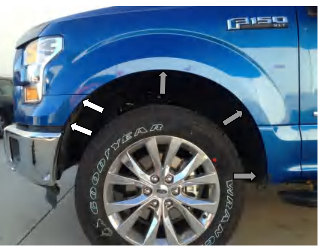
STEP 2: Locate three (3) 5.5mm bolts and two (2) 7mm bolt.

For models equipped with factory fender flares, removal of factory flares are required, please consult the vehicle service manual for factory fender flare removal.