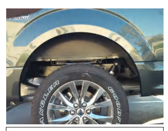
STEP 5: Clean the body areas where the Fender Flares will make contact with a clean cloth.

For models equipped with factory fender flares, removal of factory flares is required, please consult the vehicle service manual for factory fender flare removal.