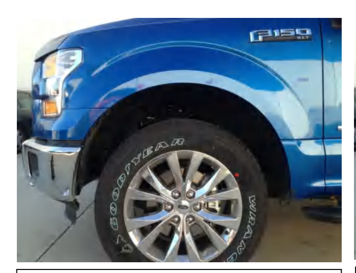
STEP 1: Clean the body areas where the Fender Flares will make contact with a clean cloth.